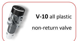
V-10 all plastic non-return valve